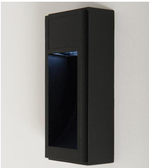
KSR1299 – Salta II